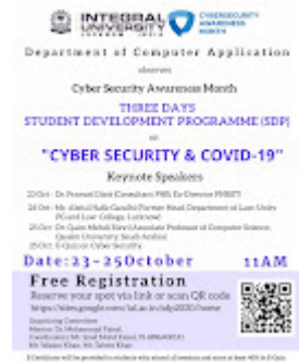
SDP on Cyber Security & Covid 19.jpg 192K