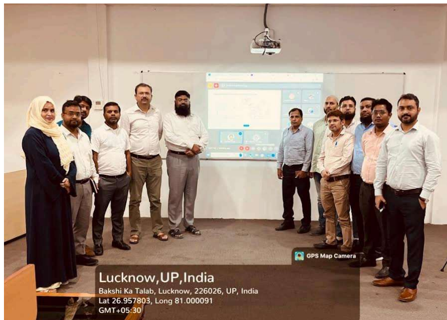
STC on Innovation in Construction and Green Building Materials at Integral University

The Human Resource Development Centre, Integral University as a remote centre of NITTTR, Chandigarh has organized AICTE Recognized Short Term Course through Information and Communication Technology (ICT) on " AI/ML and Data Science for Industry 4.0 (Basic Level) " from 21-25 August 2023 at Integral University, Lucknow. This Short Term Course is organized in association with National Institute of Technical Teachers Training & Research, Chandigarh under Ministry of Education, Government of India.