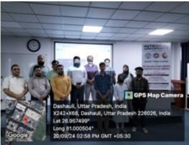
A glimpse of STC going on and Valedictory Session