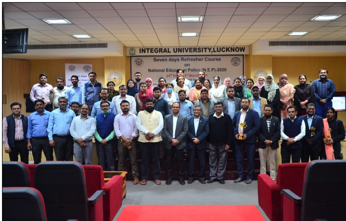
Group photo of participants and facilitators after successful completion of Seven Days Refresher Course on National Education Policy (NEP) – 2020

A Seven Days Refresher Course on National Education Policy (NEP) – 2020 has been organized by Human Resource Development Centre (HRDC), Integral University, Lucknow from 24 th February to 03 rd March’ 2021, as per following schedule: