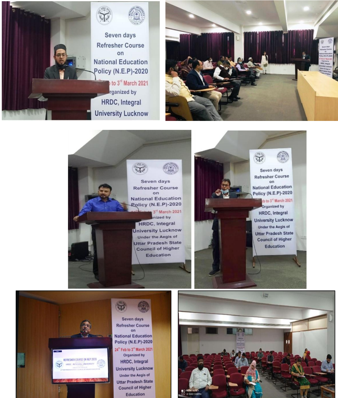
A glimpse of activities conducted under Seven Days Refresher Course on National Education Policy (NEP) – 2020 from 24.02.2021 to 03.03.2021 at Integral University, Lucknow