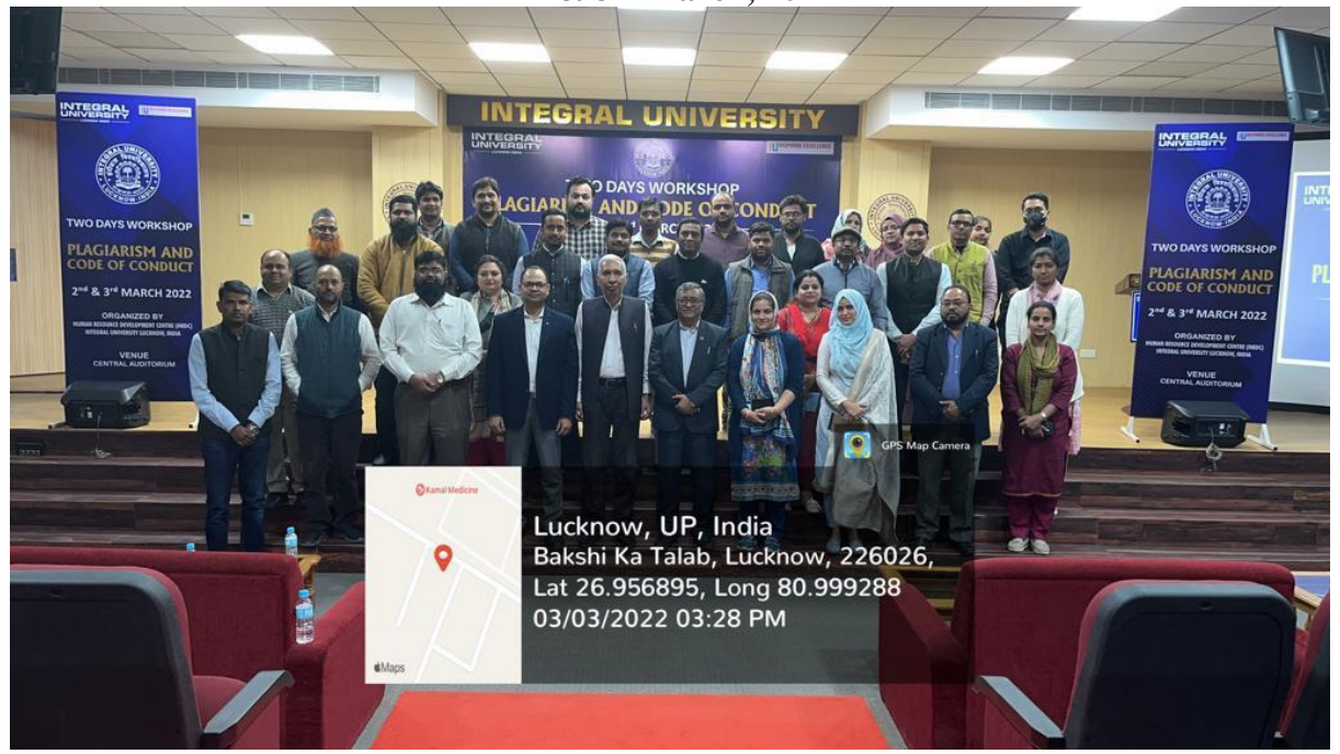
Dignitaries with participants of the workshop on Plagiarism and Code of Conduct

Report of Workshop on "Plagiarism and Code of Conduct" 2<sup>nd</sup> & 3<sup>rd</sup> March, 2022