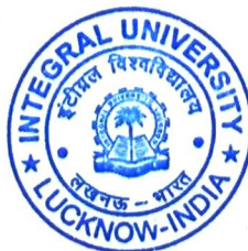
Director Admissions & Academics