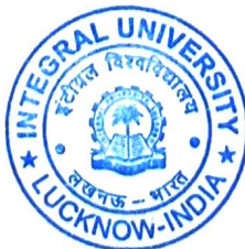
Director Admissions & Academics